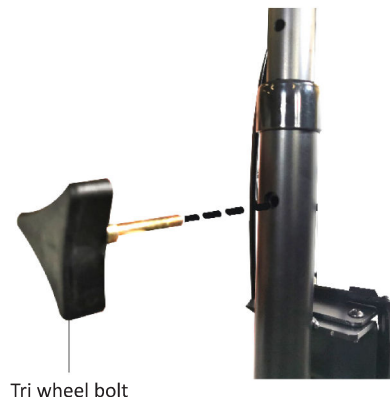
Tri wheel bolt

IMPORTANT NOTE: To adjust height of Handlebar: - Undo bolt - Adjust height - Align holes - Reinstall knob